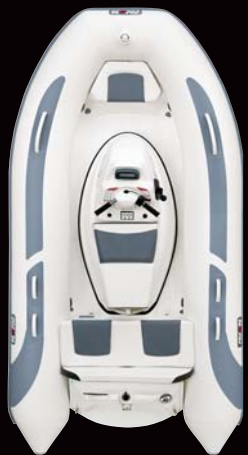
Se 320 Jet SC JC