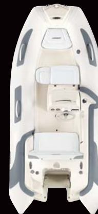
Se 360 dl