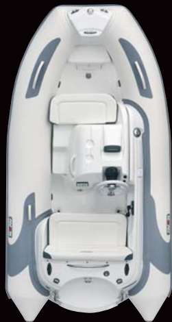
Se 320 Jet SC dl