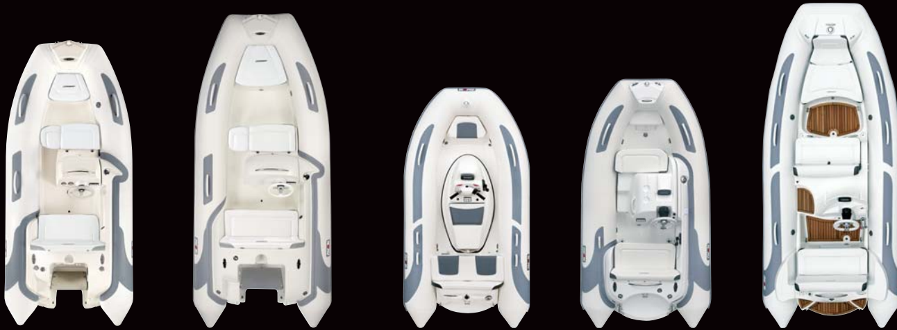
SEASPORT DE LUXE