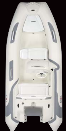
Se 400 dl