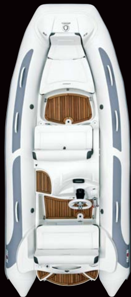
Se 430 Jet SC dl